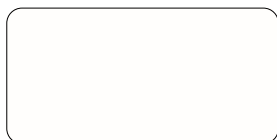
-V1 S711 (RAL 9010) Pure white