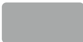
-V6 S380 (RAL 9006) White aluminium